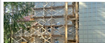
Extension of the therapeutic pedagogy center (Pskow)