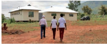
Boarding school for boys