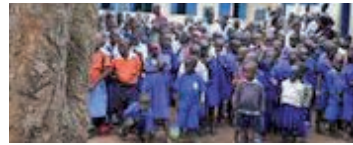
Annual tuition fees for 10 students