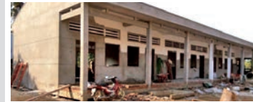
Preschool (Soc Trang Province)