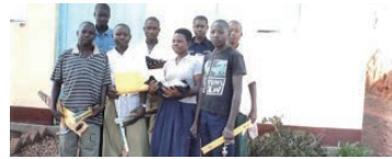
Two-year vocational training program