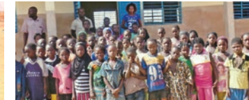
Reconstruction of a primary school