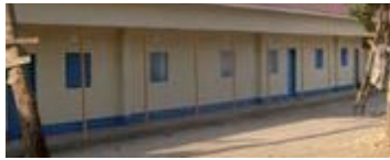
Re-roofing and paint work on outer facade of school / protective wall