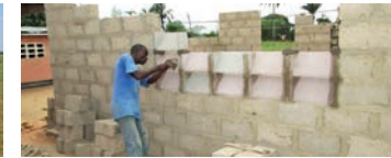
Demolition and reconstruction of a dilapidated primary school building