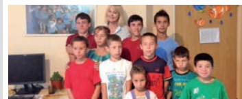
Annual costs of Casa Mirja's children's house (Pirita)