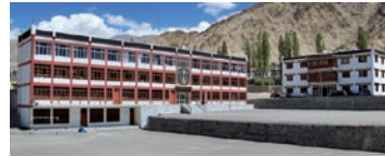
School for disabled and non-disabled children