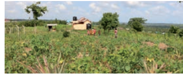
Classroom for Vocational Training Center