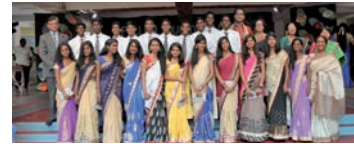
Expansion of a school in the Youba village