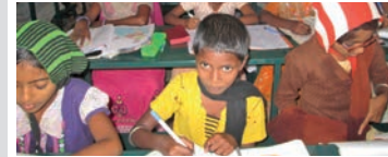
Water fountain for students in the Youba village