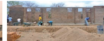
Double classroom at Mpalapata Primary School