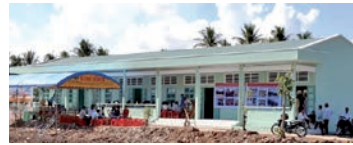
Primary school (Soc Trang Province)