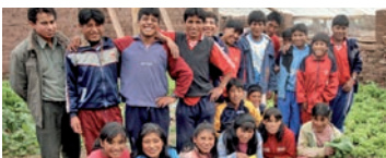
Training program for teachers (St Martin, Huanuco, Cusco)