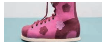
Leather sewing machine (orthopedic shoes), therapy courses for 10 children