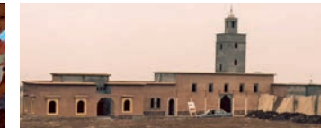
Building completion in the children's village