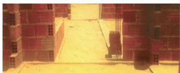
Youth center (Aracati)

Brazil Deutsch/Brasi- lianischer Kulturverein e.V.