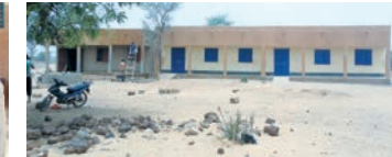
Expansion of a school in the Youba village