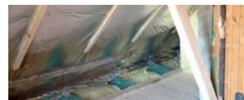
Remodeling and renovation of Casa Eva's girls house (Tichindeal-Ziegental)