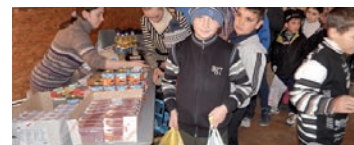
Annual support for 28 orphans (Cernaleuca)