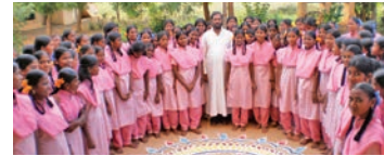
Reconstruction of a primary school