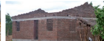
Two teachers houses at Mthawira Primary School