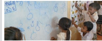
Preschool and day care center (Trakiet village)