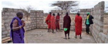
Two preschools