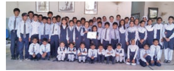
Annual tuition fees for 130 students (Mianwali)