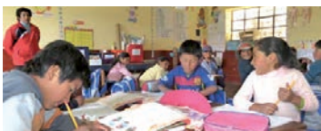
Water tank, printer and furniture for primary school (Amaru)