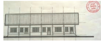
Solid school building (Mongnam municipality)