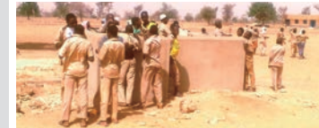
Water fountain for students in the Youba village