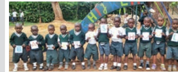
Sports field: lot, playground equipment, protective fence