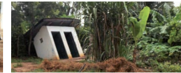
Emergency assistance because of a tornado