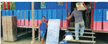
Printer, sound system,solar system and white board for school (Iquitos)