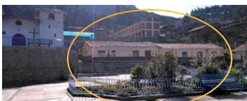
Beds, mattresses, blankets and clothes for students (Waynakunaq)