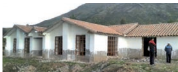
Clothes and mattresses for students / renovation work at school (Ayarkunaq)