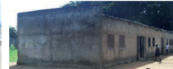
School for disabled and non-disabled children