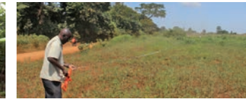
Residential unit for orphanage